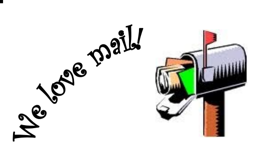
Camp Address: Brentwood Hills Christian Camp c/o Camp Leatherwood 3235 Westcott Road White Bluff, TN 37187